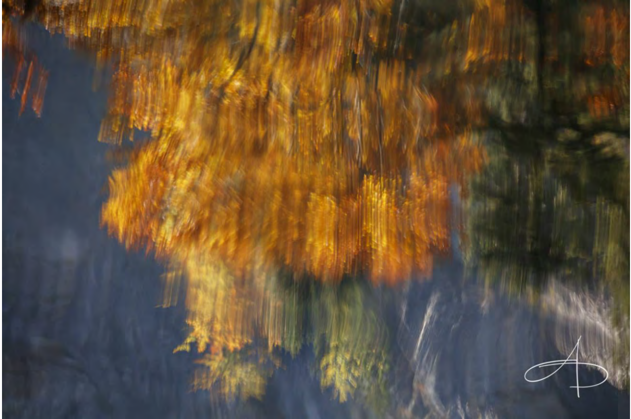
Alexandre Plattet: Expression automnale (autumn expression) Fine Art Abstract Nature Photography, 105 x 70 cm, 2015