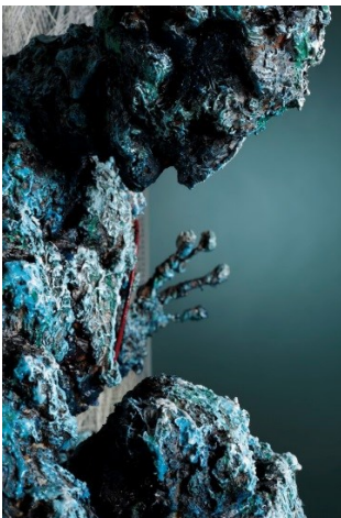
Oleg Davydenko Penetration Oil, Wire, Thread, Author's technique, 180x120x70 cm