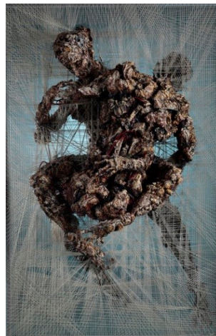
Oleg Davydenko Passion Oil, Wire, Thread, Author's technique 180x120x80 cm