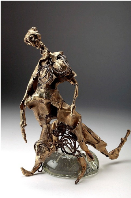
Oleg Davydenko Amazon Bronze, wire, stone, 50x20x30 cm