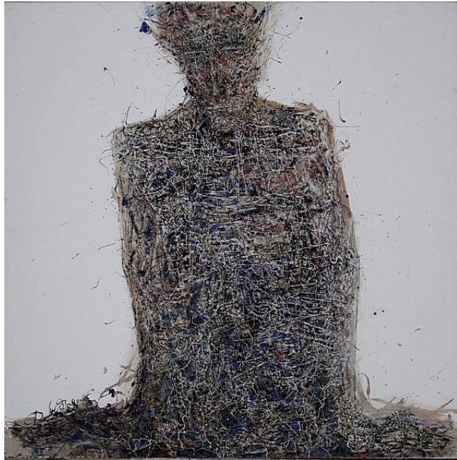
Liudmyla Davydenko One Canvas, oil, 140x140 cm